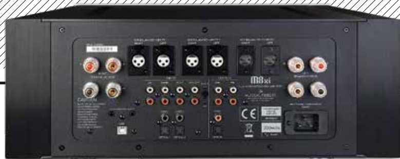
ABOVE: Five line ins (three on RCA, two balanced on XLRs), USB-B and pairs of coax/optical digital ins are joined by balanced and single-ended pre outs (XLR/RCA), one fixed line out (RCA) and coax/optical digital outs. There are two sets of floating (live negative and positive) 4mm speaker outlets per channel for easy bi-wiring

Merging Pyramix workstation, this fabulously detailed rendering finds harps and flutes still tonally vivid in a sea of strings stirred by no fewer than 30 first and second violins.